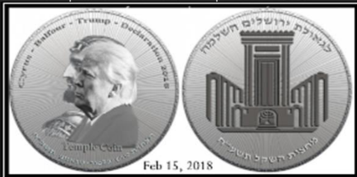
The new Temple Coin in honor of Israel's 70th year