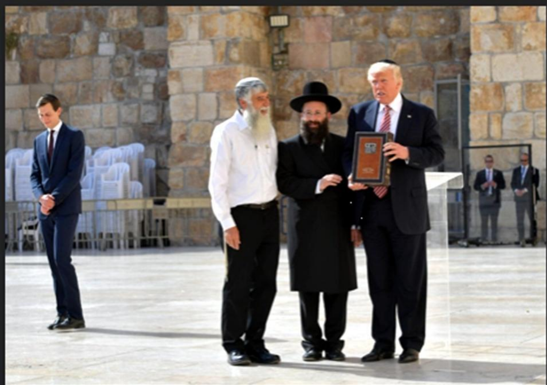
Trump Visits Western Wall, Church of the Holy Sepulcher in Jerusalem