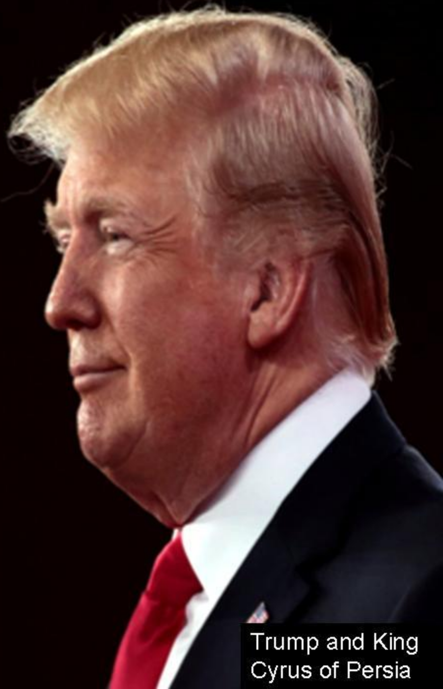
Trump and King Cyrus of Persia