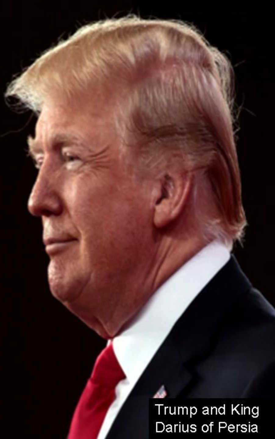
Trump and King Darius of Persia